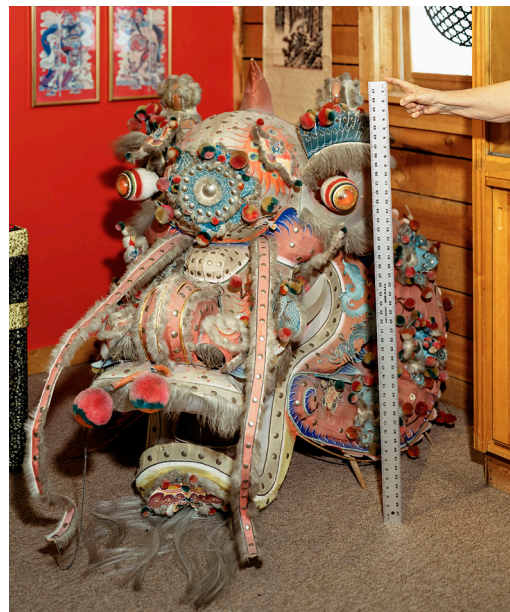
→ Evanston, Wyoming, 2019 Production CRP