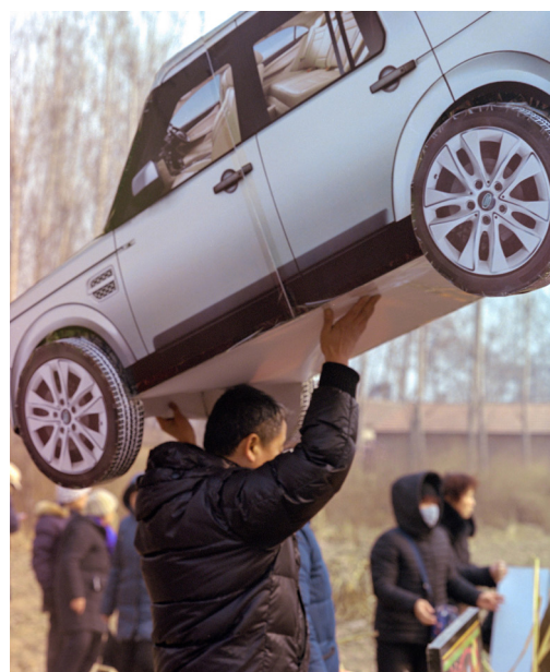
→ Paper Car, 2019 Production CRP/ © Wang Yingying