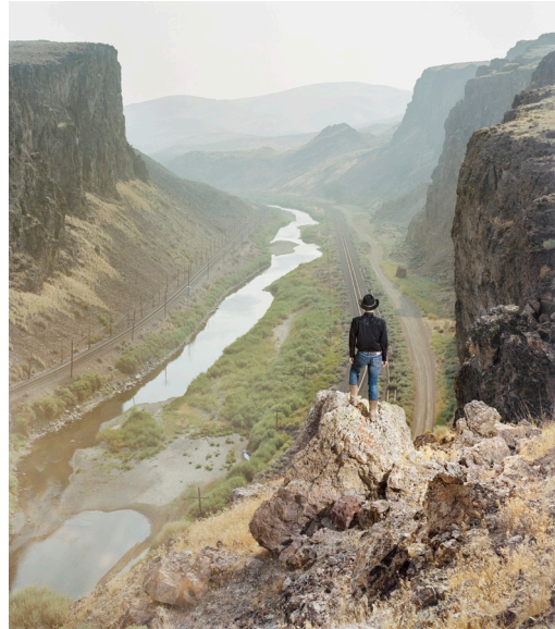
↗ Self-Portrait (A Chinese Cowboy), 2018 Production CRP/ © Zheng Andong