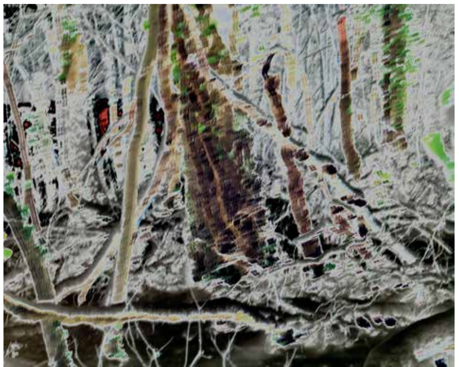
↗ Jean Luc Tartarin, de la série Entre(s) , 2013, tirage type C Digital © Jean Luc Tartarin