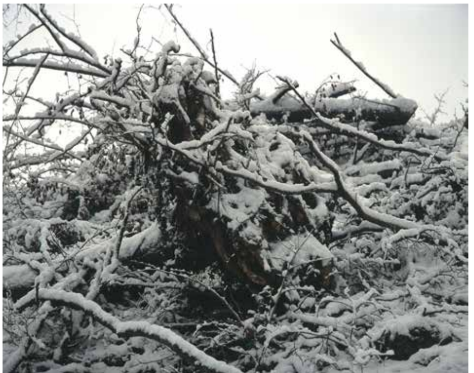
↗ Jean Luc Tartarin, de la série Entre(s) , 2012, tirage type C Digital